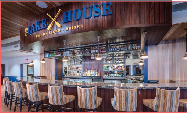
THE LAKE HOUSE