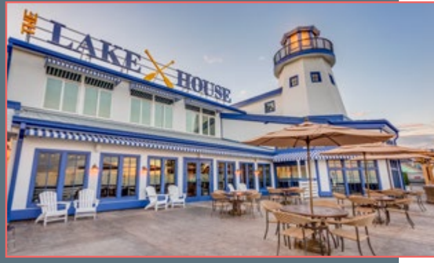
THE LAKE HOUSE