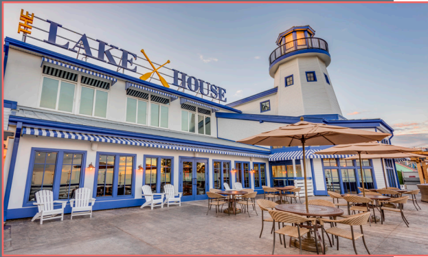
THE LAKE HOUSE