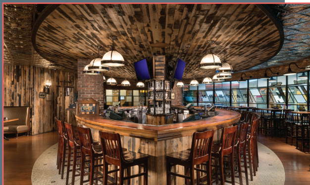
THE UPSTATE TAVERN