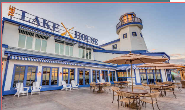
THE LAKE HOUSE